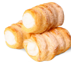
MINI PUFF PASRTY