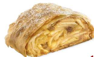
APPLE STRUDEL Lactose-free