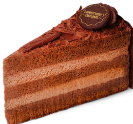
TRUFFLE CAKE Gluten-free