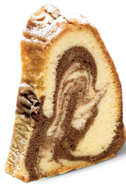
LANDTMANN'S ORIGINAL GUGLHUPF Lactose-free