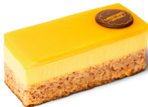
MANGO CAKE Vegan